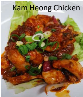
Kam Heong Chicken

Kam Heong Chicken / Fragrant Spicy & Sweet Chicken 甘香明鸡 $13.90