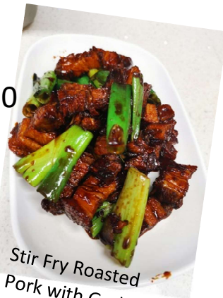
Stir Fry Roasted Pork with Garlic