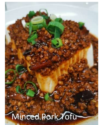
Minced Pork Tofu