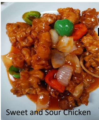
Sweet and Sour Chicken